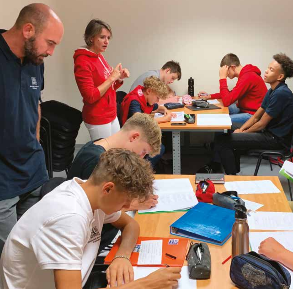
Group and accompanied study time.