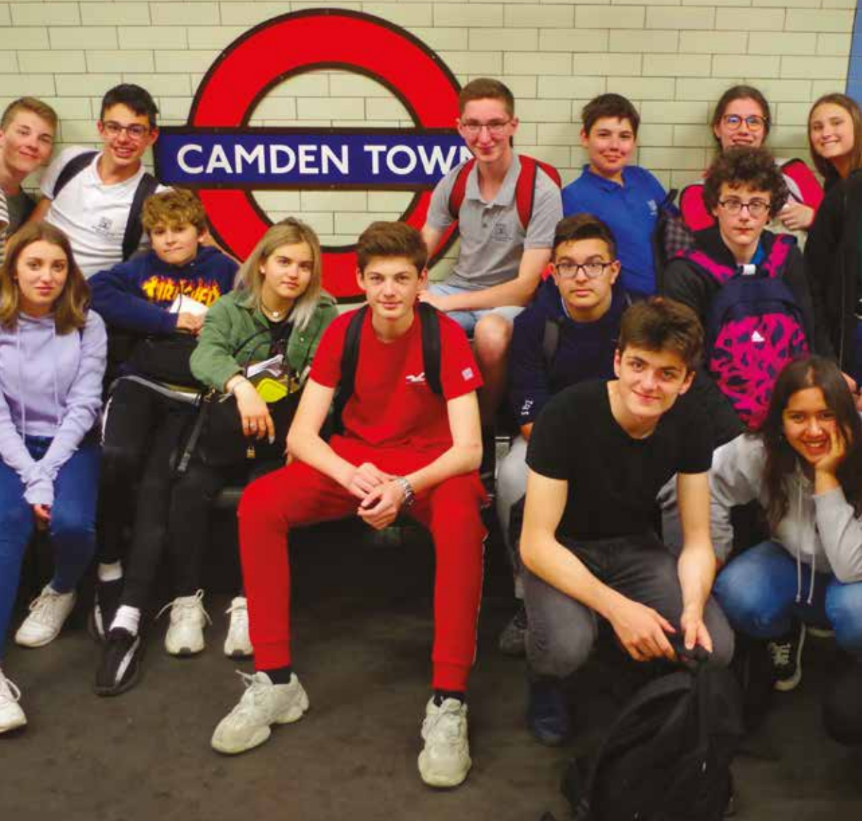
Language trip to London