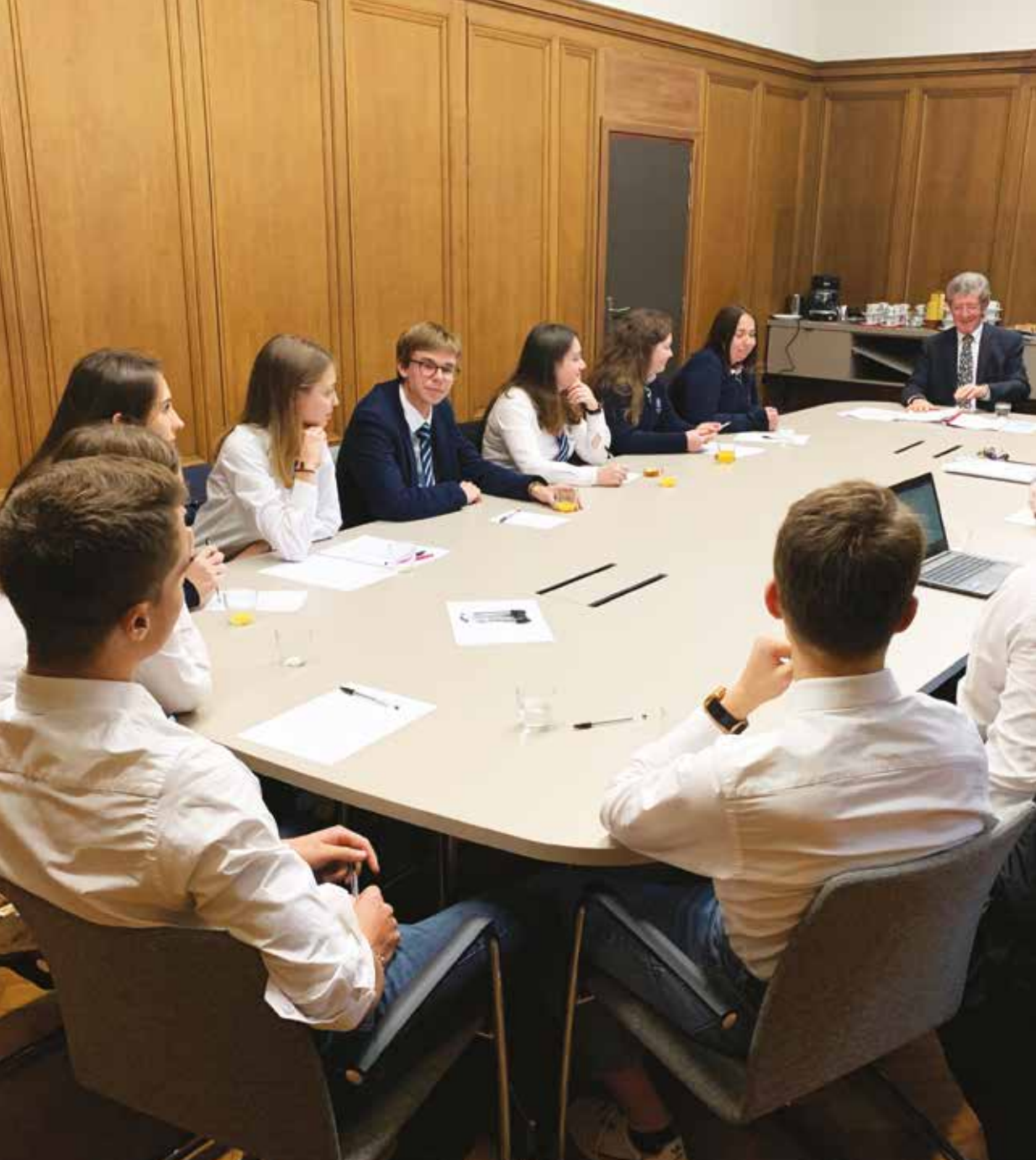
Meeting between the local Member of Parliament and some older students on the subject of school reforms.